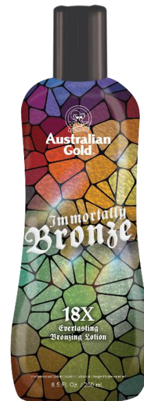
8.5 Fl Oz | 1.5 Fl Oz Packette

Heavenly Haze – Strawberry, Raspberry, Black Currant, Lemon, Violet, Amber & Patchouli.